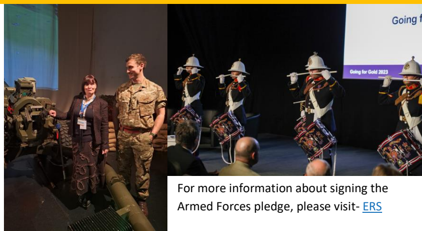
For more information about signing the Armed Forces pledge, please visit- ERS